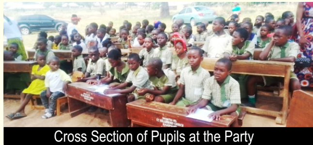
Cross Section of Pupils at the Party