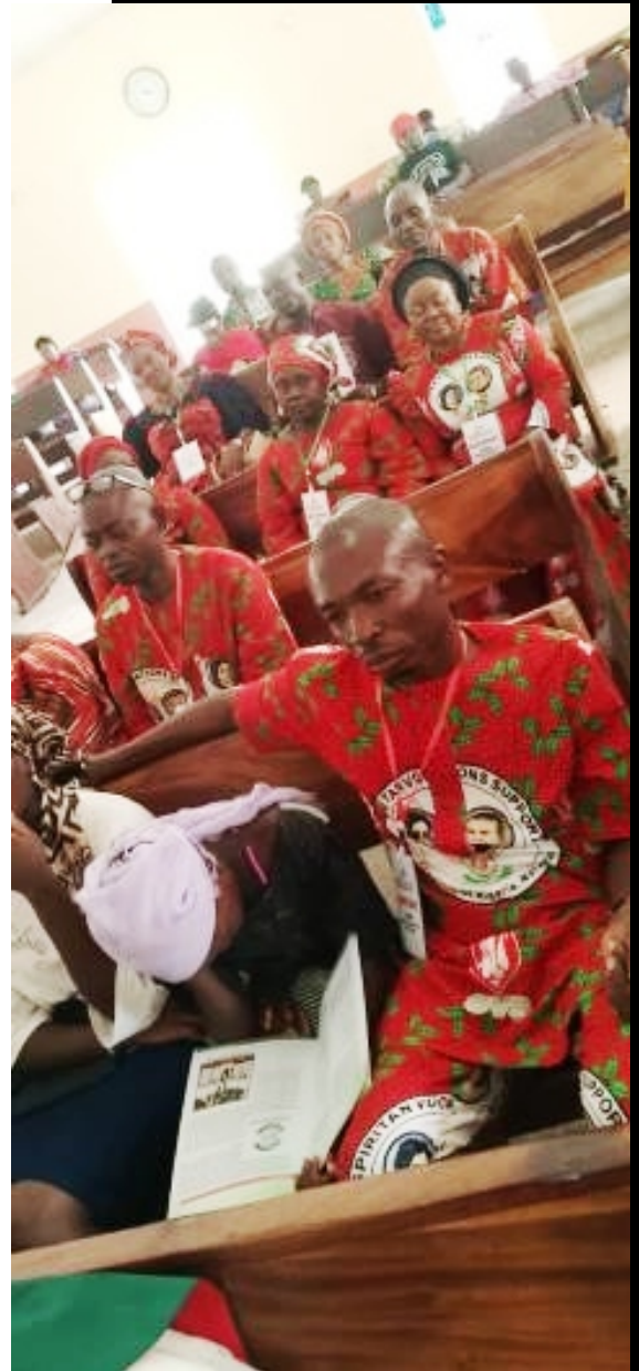
Members of SVS During the Eucharistic Celebration